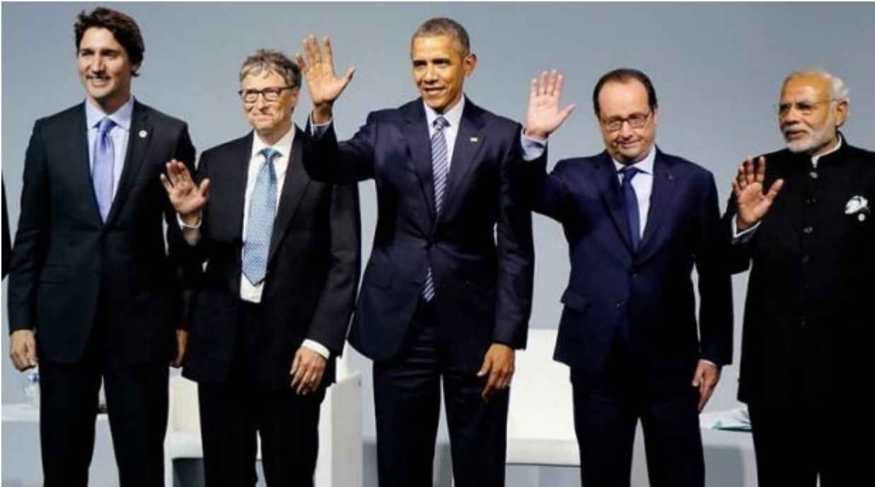
Canadian Prime Minister Justin Trudeau, Microsoft co-founder Bill Gates, Former US President Barack Obama, French President Francois Hollande and Indian Prime Minister Narendra Modi at the Paris Climate Conference in 2015.

After rising by 0.113C per decade between 1950 and 1999, temperatures appeared to have stabilized between 2000 and 2014, despite rising levels of CO2 emissions, which climate change scientists said were responsible for the earlier warming.