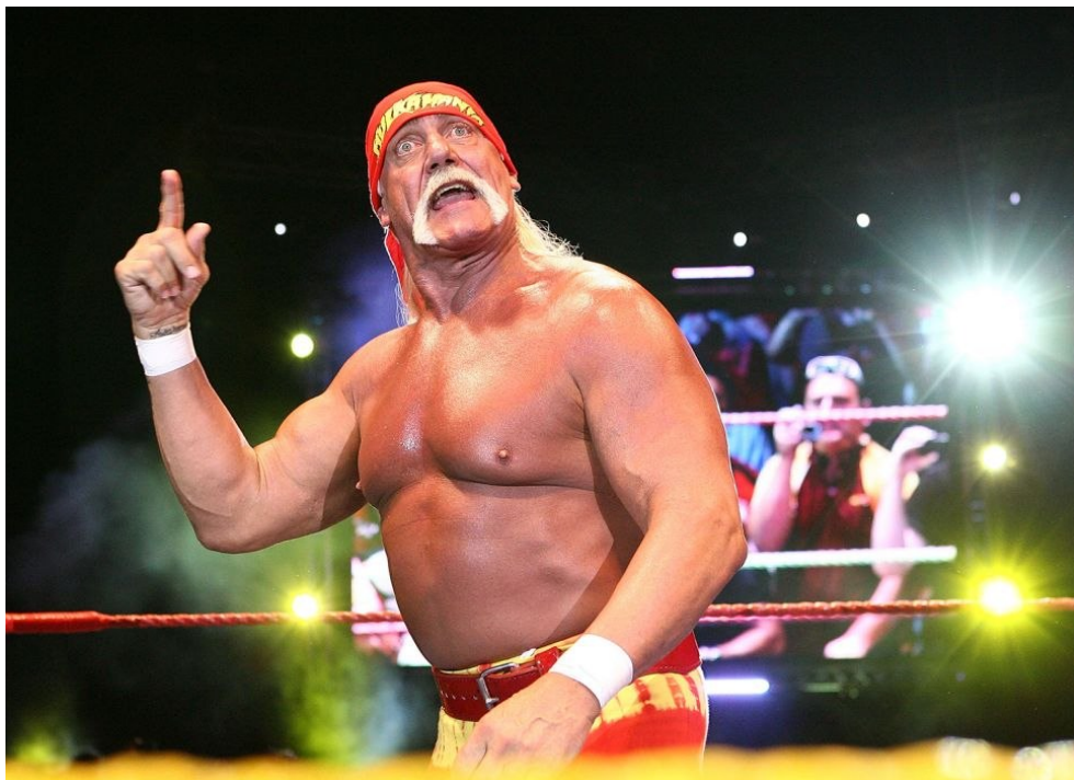
The Hulk