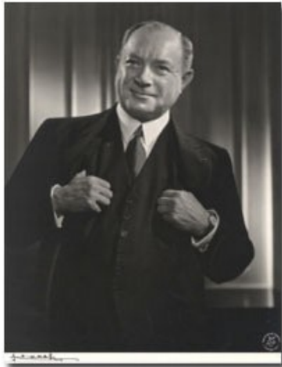
The David Sarnoff Library

Things seemed to be going swimmingly for Armstrong for a while, but it was at this point that a remarkably smug asshole came into the picture.