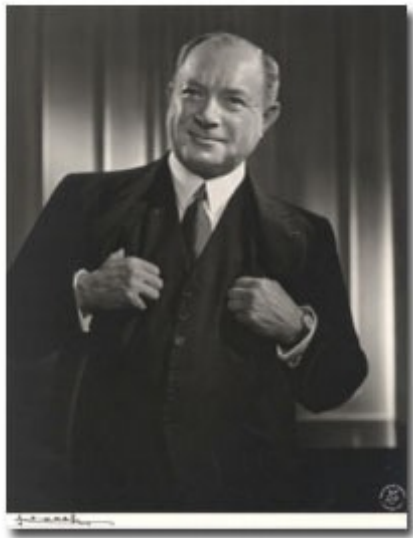
The David Sarnoff Library

David Sarnoff: Smug magazine's Person of the Year, 1921-1967.