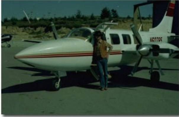
DigiBarn Computer Museum

Let he who hasn't blown off a corporate giant to go flying cast the first stone.