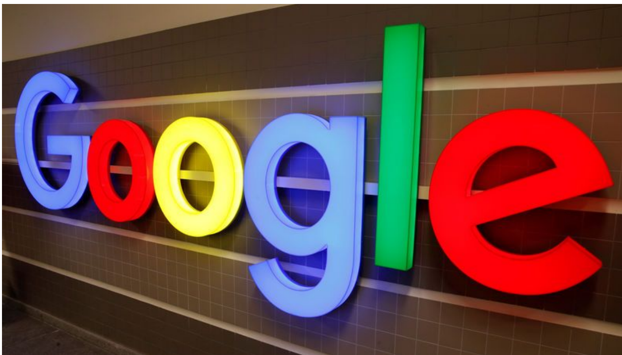
FILE PHOTO: An illuminated Google logo is seen inside an office building in Zurich, Switzerland December 5, 2018.